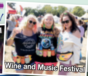
Wine and Music Festival