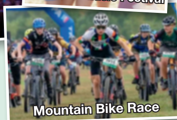
Mountain Bike Race

Granite Hill has proudly hosted the internationally acclaimed Gettysburg Bluegrass Festival since 1979! This bi-annual event is a celebration of both traditional and contemporary bluegrass music, with a mix of classic country, newgrass, and other related acoustic styles. Concerts are held on a stunning timber-frame stage, set against the picturesque backdrop of our 150 acres of rolling farmland.