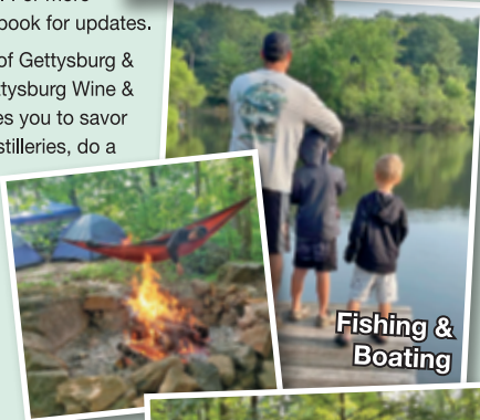
Fishing & Boating

300 Campsites • Up to 50-amp Electric • B&B • Rustic Camping Cabins • WiFi Hotspot • Swimming Pool • Tennis Courts • Miniature Golf • Dog Park • Trout Fishing Pond • Playgrounds • Basketball • Shuffleboard • Horseshoes • Red Shed Café • Bass Fishing Lake • Boat Rentals • Sand Volleyball • Softball Field • Hayrides • Beer & Wine • Sterling Pavilion • Live Entertainment • Clean Restrooms • Seasonal Site Rentals • Honey Pot Service • Camper Storage • Tractor Pulls • Laundry Rooms • Game Room • Theme Weekends • and much S'more!