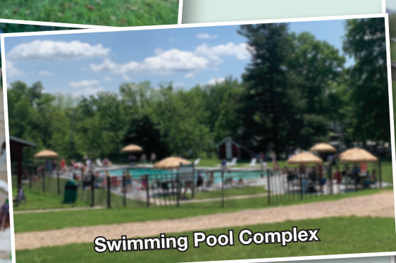
Swimming Pool Complex