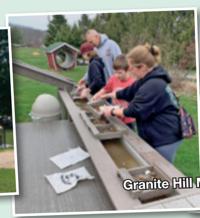
Granite Hill Mining Co.